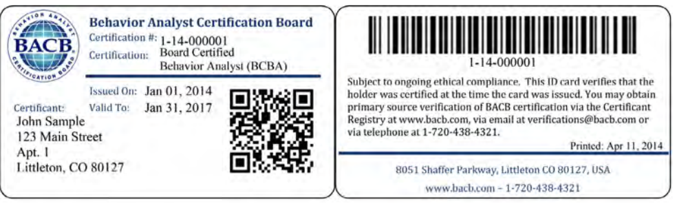
Sample Wallet Card Front

The BACB now offers wallet cards for its certificants through the BACB Gateway. The wallet card includes the certificant's name, mailing address, certification type, certification #, initial certification date, and certification expiration date. In addition, the card includes a bar code embedded with the certification # and a QR code embedded with the name, certification #, and certification expiration date. We anticipate that approved continuing education (ACE) providers will increasingly use scanners to record your attendance at continuing education events. You should take this card with you to these types of events to facilitate more efficient processing of your continuing education units.